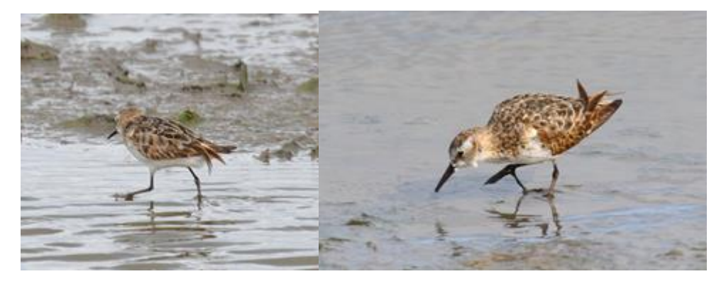
Little Stint moulting into non-breeding plumage.

This report described a bird moulting from breeding into non-breeding plumage and supported by several photographs showing diagnostic plumage features, the strong rufous edges to remaining but worn tertials as well as the greater and median wing coverts. The longer legs, finer tipped bill and small headed appearance also help to distinguish Little Stint from Rednecked Stint, Calidris ruficollis .