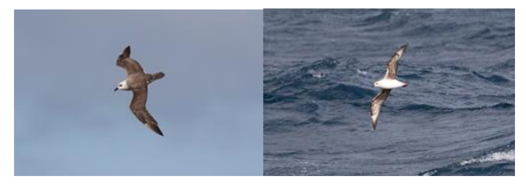
Kermadec Petrel (pale morph)

This is a first record for the state and as illustrated by the photographs below, provided excellent views as it flew around the boat. It is a pale morph showing an almost all white underbody and head. A possible confusion species is the White-headed Petrel, Pterodroma lessonii , but this bird is distinguished from the latter by the underwing pattern, the white shaft streaks on the primaries visible on the upper wing, the lack of a black mark around the eye, dark rump and upper tail, and the smaller head.