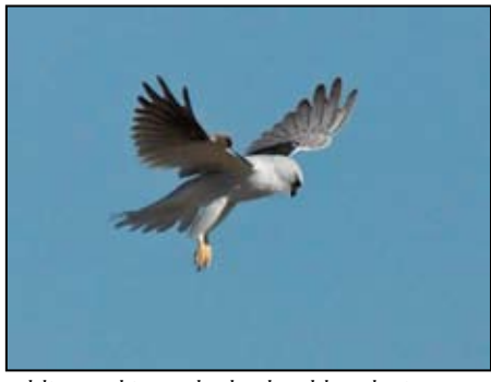
Aldinga skies: Black-shouldered Kite and below, White-bellied Sea-Eagle and its aggressors.