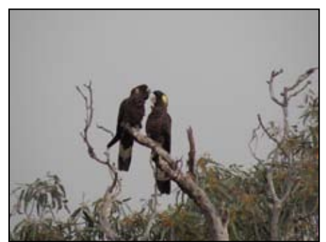
Yellow-tailed Black-Cockatoo entertained watchers at Currency Creek.