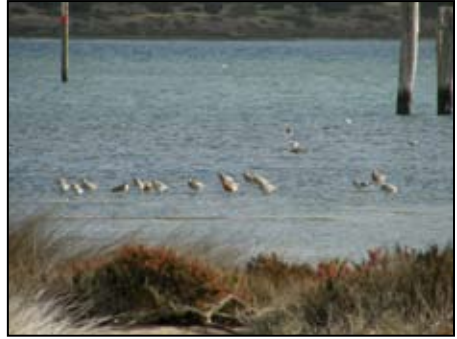
Bar-tailed Godwit below Goolwa barrage.