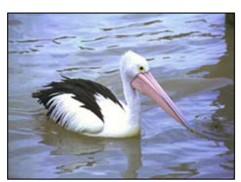
Australian Pelican on the River Murray at Mannum.