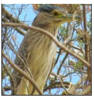
Above. Nankeen Night Heron peered from the pine tree near the barrage. Below. Although there was little water in the river the birds gathered on the verges.