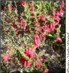
Epacris impressa, Mt Billy