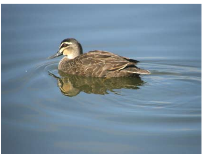
Serene Pacific Black Duck at Laratinga.

Seven of us drove on to Laratinga wetlands at Mt Barker where we were met by two more members and a welcome visitor. This time we were able to walk with our backs to the sun making identification of the water birds much easier. Six species of duck were seen including two Shovellers and a number of Hardheads. A couple of times the Little Grassbird forgot its need to be secretive, affording us some good views as it foraged among the reeds. In the foliage around the ponds we saw Superb Fairy-wrens, New Holland Honeyeater, some Dusky Woodswallow and a Bronzewing as it made its escape. In all we saw 44 species at the site, more than enough to make it a very successful day. Pat Uppill