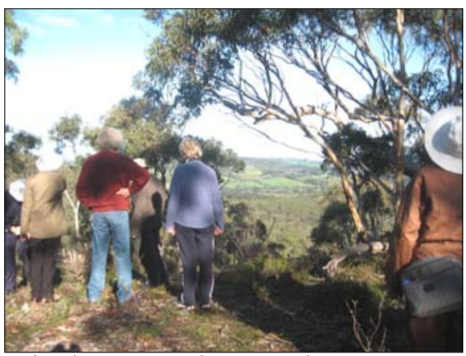
Looking down on creation from Mt Magnificent CP.