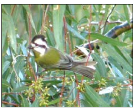
Well camouflaged Crested Shrike-tit at Inman Flats.

We found a purple patch quite early in the walk and everyone lingered while we enjoyed great views of Crested Shriketit (a first for several of our new members)