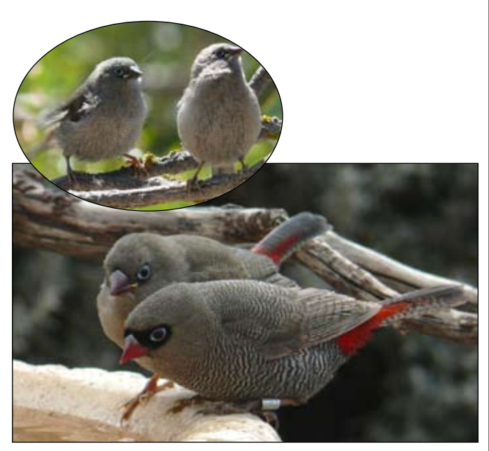
Above, White-bellied Sea-Eagle at Waitpinga Cliffs. Below, Beautiful Firetail and chick.

Shortly after this discovery I observed another adult male and later I was even more thrilled to see a juvenile coming with the adult pair. But the highlight occurred some days later when three young fledglings appeared with the parent birds. What an amazing start to the birding year! Elizabeth Steele-Collins