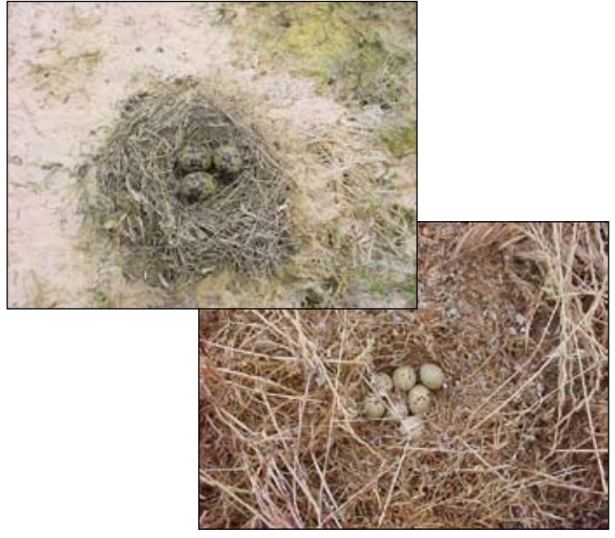
Black-winged Stilt nest (left) and a clutch of Stubble Quail eggs (right) at the wetlands in the Beyond development at Pt Elliot.