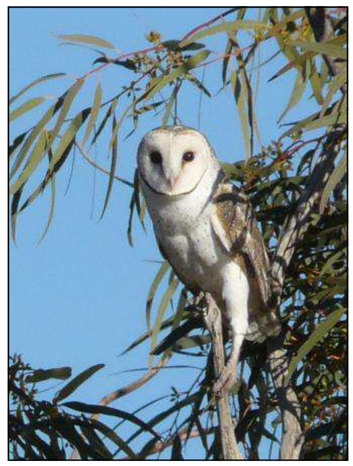
Barn Owl