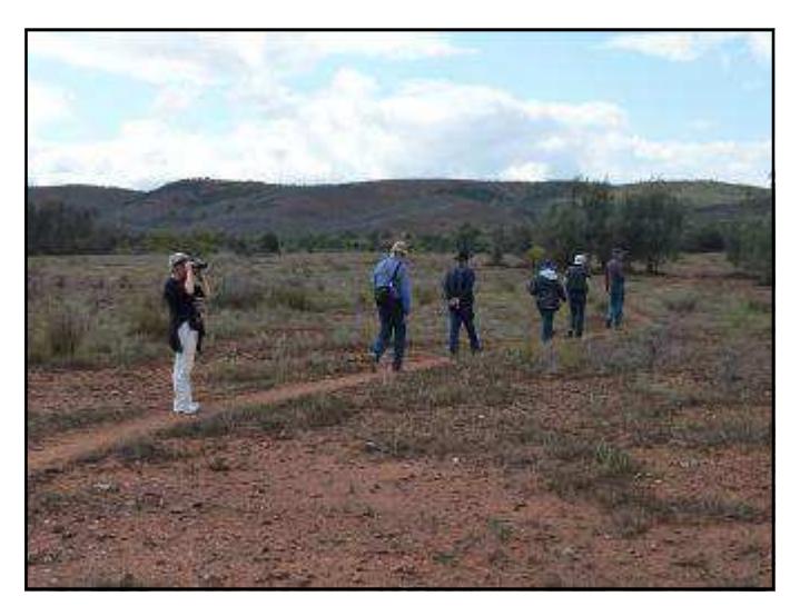
4 Birdwatch December 2011