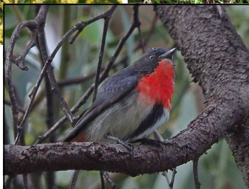
Mistletoe Bird