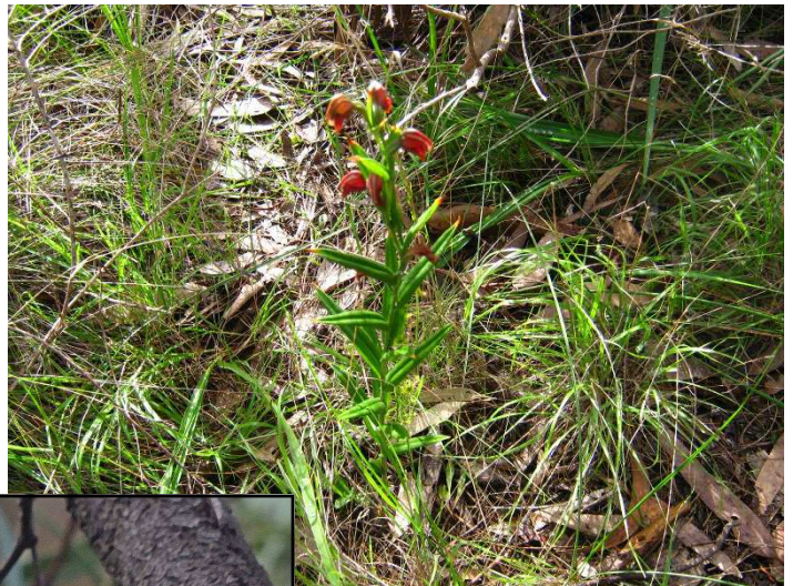
Blood Greenhood Orchid