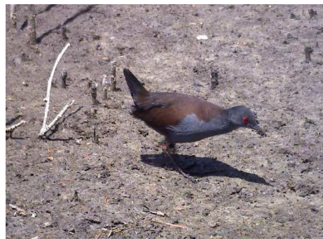
Spotless Crake

If you spot any of the species on our “rare” species list in fringing habitats around Lakes Alexandrina/Albert and their tributaries (Currency Ck, Finniss River, Tookayerta Ck) between Sept 2012 and Jan 2013. Please describe the location and habitat where you saw the bird if possible (i.e. Lewin’s Rail sighted emerging from Phragmites reedbeds at Tolderol Game Reserve).