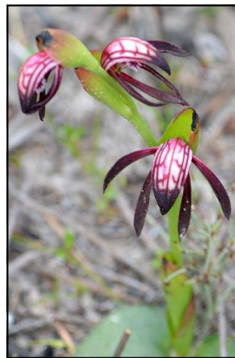
Red Beaks Orchid