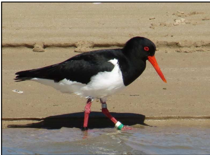
Pied Oystercatcher with flags

To join, download the membership form at: www.birdlife.org.au/documents/JOIN-photographyform.pdf and return to BirdLife Australia, Suite 2-05, 60 Leicester Street, CARLTON VIC 3053.