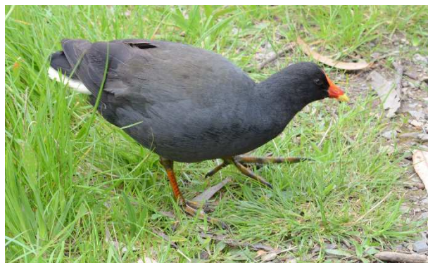
Dusky Moorhen