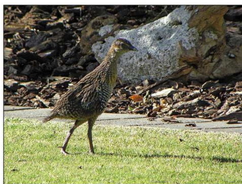
Buff-banded Rail