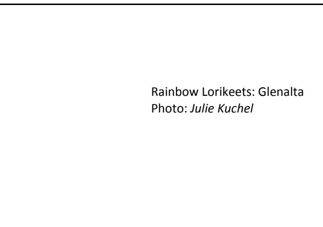
Rainbow Lorikeets: Glenalta