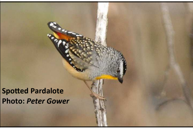
Spotted Pardalote