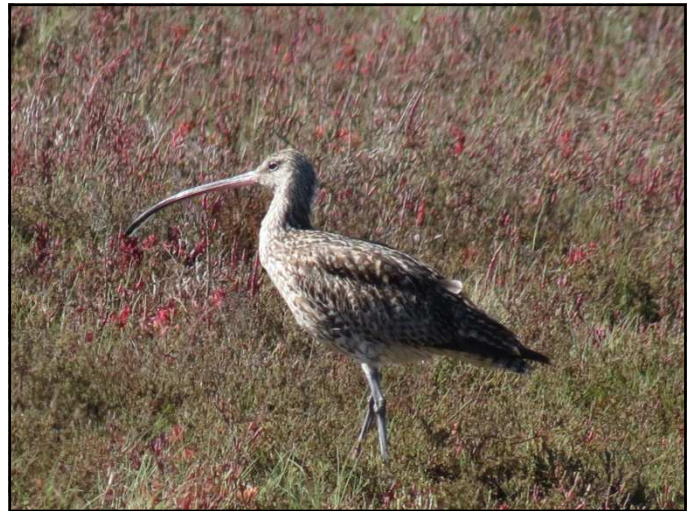
Eastern Curlew