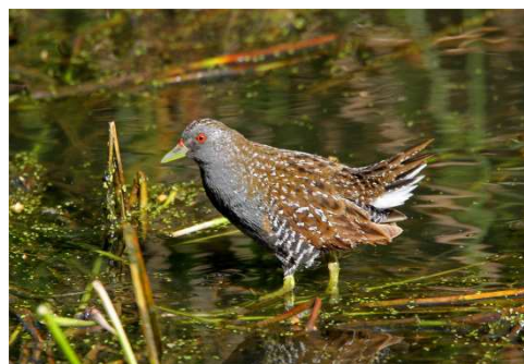
Spotted Crake