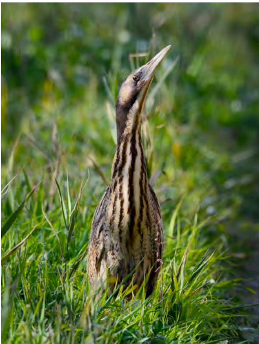
Figure 2. The Australasian Bittern as first seen on the track near Bay 11, in typical pose. Just after this shot was taken the bird started to walk away down the track very slowly as seen in Figures 3 - 9. All images were taken with a Nikon D700 DSLR camera with a Nikon 200-500 mm zoom lens set on 500 mm.

I observed and photographed the Australasian Bittern struggling with the House Mouse (Figures 5, 6 and 7). The bird did not shake or batter the House Mouse, but manipulated the struggling animal into position before, after many seconds, swallowing it head first. The