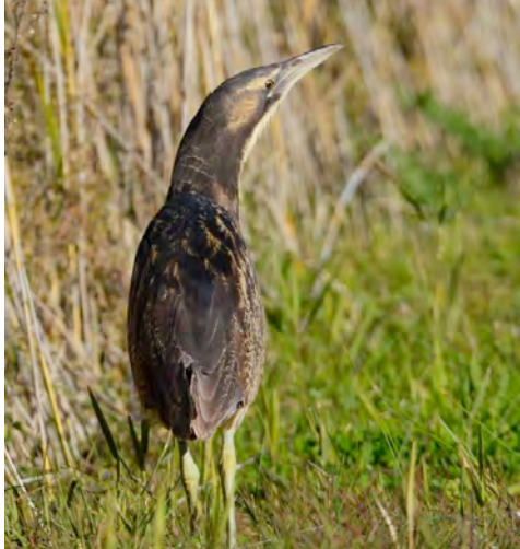
Figure 9. The bittern stretched its neck up twice before fully swallowing the mouse