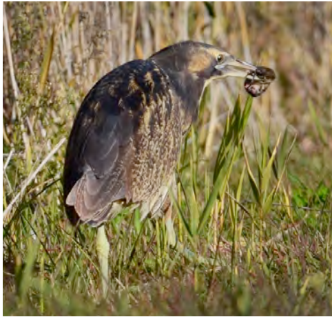
Figure 5. Manipulating the mouse in the bill