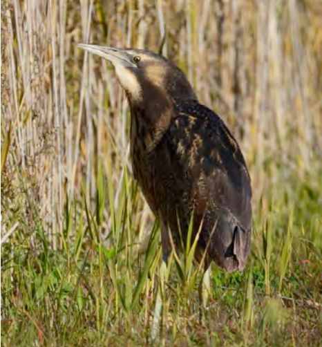
Figure 8. The mouse is seen as a bulge in the crop area of the bittern's throat