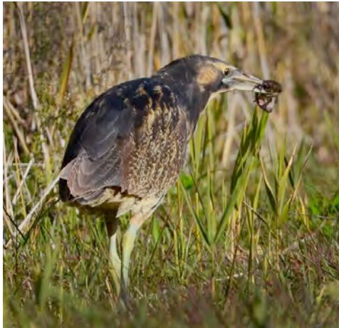
Figure 7. The mouse has stopped struggling and is flipped around head-first and swallowed