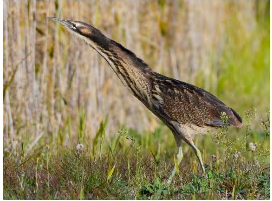
Figure 3. The Australasian Bittern skulking along the track prior to catching the mouse

House Mouse could be seen as a lump in the bittern's crop area (Figure 8) and then the bird raised its head a couple of times and swallowed the animal. It stretched its head up a couple more times and then resumed walking slowly along the track. As I continued to photograph the bird for another 2-3 minutes, following for it for about 20 m, it took flight and disappeared over the reeds and was not seen again for the rest of the day.