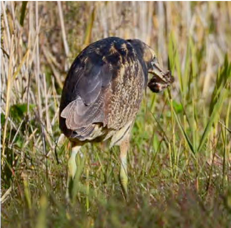
Figure 6. The mouse is struggling and the bittern continues to squeeze it into position