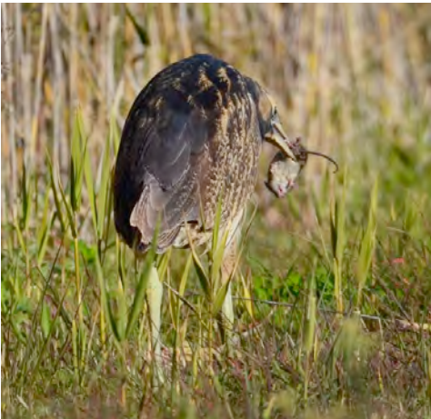
Figure 4. Soon after capturing the mouse