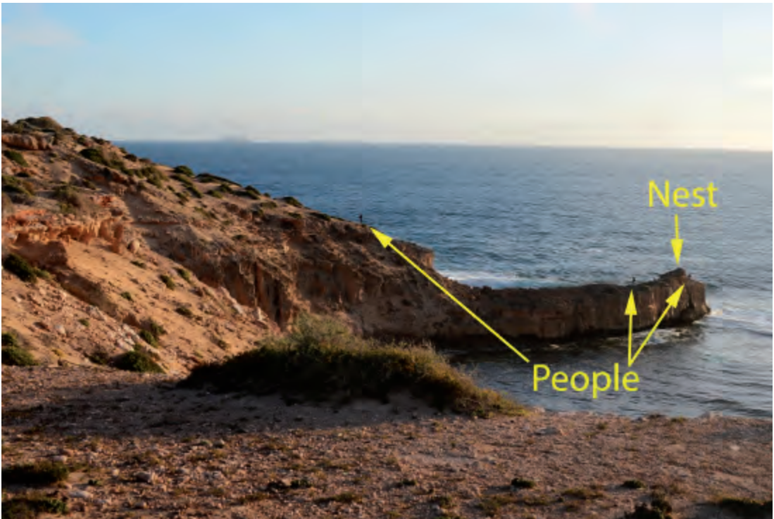
Figure 3. An example of a highly disturbed Osprey nest, near Elliston on western Eyre Peninsula. Situated next to a popular surfing location, the nest is in full view from a recently upgraded carpark (210 m distant) and lookout. Added to this, some surfers use the headland as an access/egress point to the surf-break just offshore. This territory was occupied during the 2008-10 surveys but has been abandoned since.