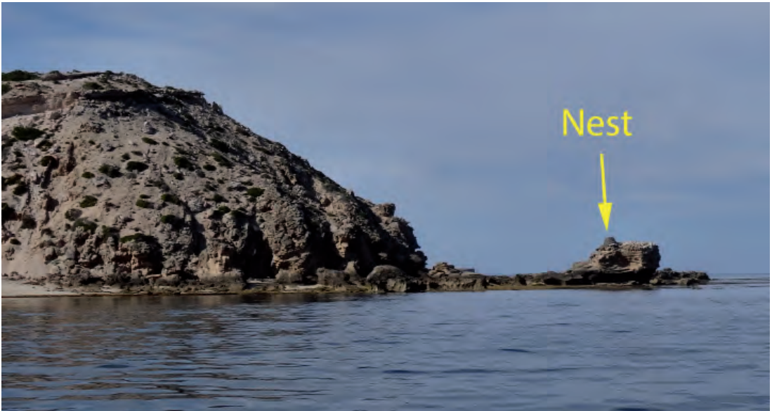
Figure 2. A typical Osprey nest placement in South Australia's open coastal landscapes. The nest, although 'protected' in a National Park, is vulnerable to climatic events (e.g. storm surge) and to disturbance from recreational activities above nest-level. It also can be readily accessed by people and predators (e.g. foxes) at low tide.