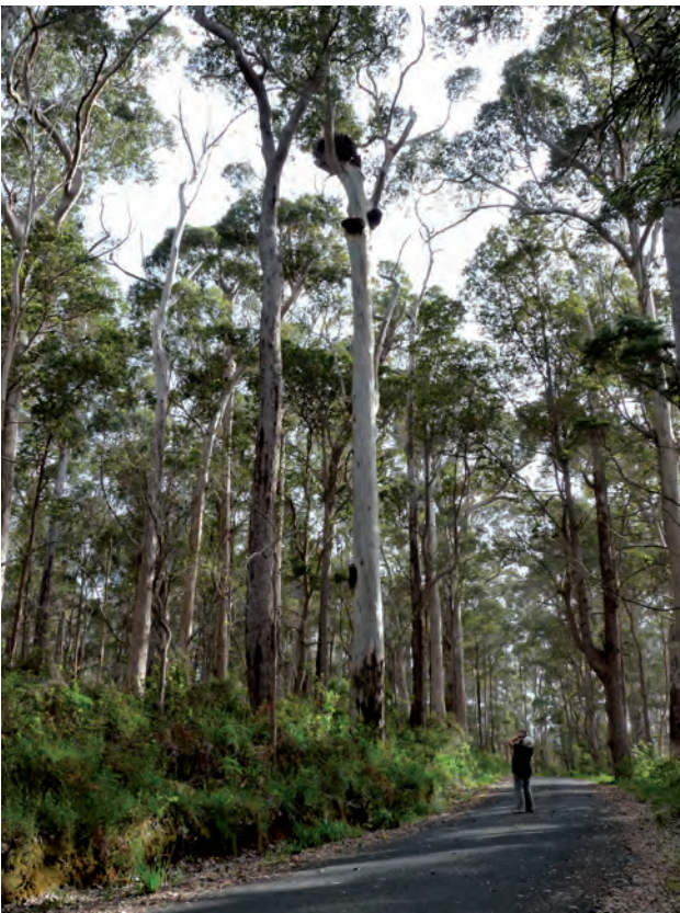
Figure 5. In warm-temperate to tropical climes in Australia most Osprey nest placements are in coastal or estuarine forests, often in similar settings to this interstate example. At this nest, in contrast to behaviours near typically exposed nest sites in South Australia, the parents continued feeding the young while vehicle and foot traffic on the road below were totally ignored!