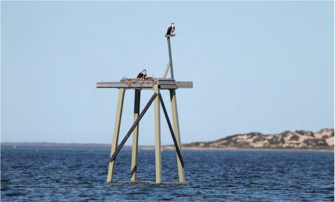
Figure 4. The resident Osprey pair immediately adopted this up-graded nest platform built by local oyster farmers at Denial Bay in 2013. The original platform, which had been in place since 1991, had been re-built twice after collapsing under the weight of nesting material or from storm damage.