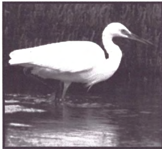
Little Egret photographed by Kay Parkin at Price Saltfields in January 2012

With all the construction going on there I was very surprised to find that we recorded 81 species between us. We moved to the top of the hill to view the inlet where 2 Hooded Plovers