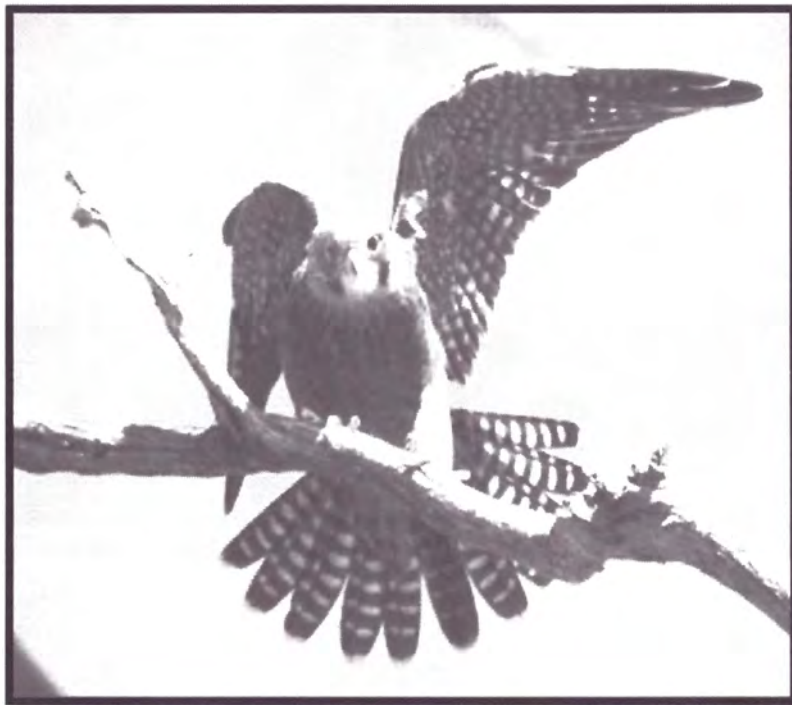
Hobby at Aldinga in November 2011

Anstey Hill is a park of hills & gullies. It is close to the city so we can make an early start at 8am. We meet at Gate 3 on Perseverance Road, Tea Tree Gully (0.8km from the North East Road end).