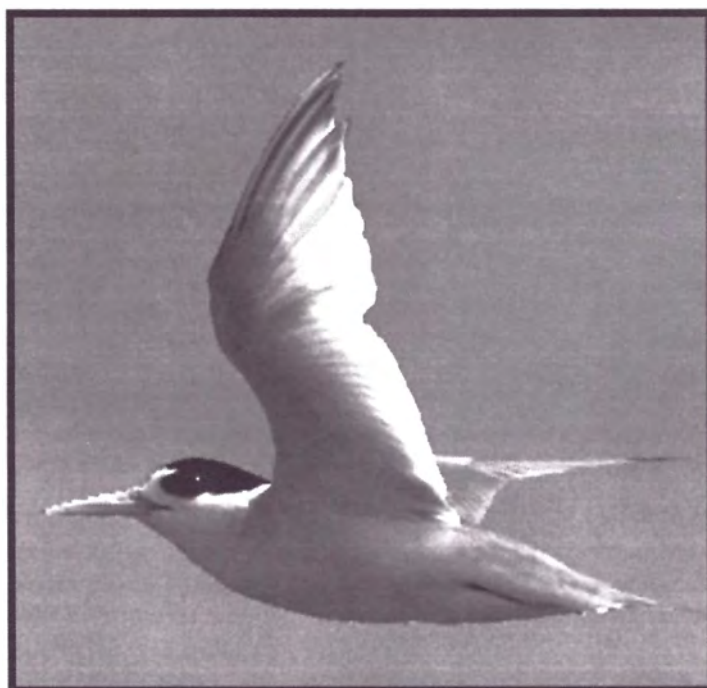
Fairy Tern at Price Saltfields, Jan 2012