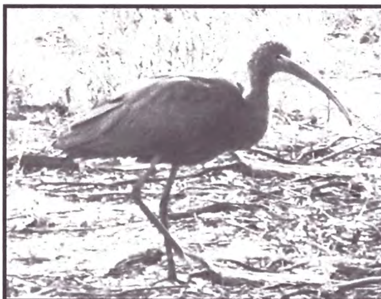
Glossy Ibis photographed by Brian Haywood near Ceduna on 31/10/2011