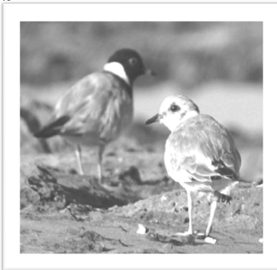
Juvenile Hooded Plover DK with a Banded Adult at Parsons Beach on 14/2/13

If you see a Hooded Plover with a coloured flag, please let us know! The requirement is that this viewing is done only from a distance of 100m; using binoculars, a telescope or a