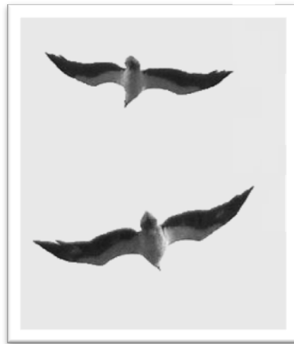
White-bellied Sea Eagle Pair, above Waitpinga Cliffs, 13 th November 2013

Since we wrote the above the White-bellied Sea-Eagle pair have been sighted circling together above Waitpinga Cliffs before sunset on Wednesday 13 th November. Of course another nest failure is still sad and very concerning but at least the female is still with us.