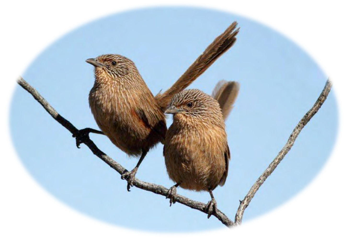
Birds SA is the operating name of The South Australian Ornithological Association Inc.

c/- South Australian Museum, North Terrace, Adelaide, SA 5000