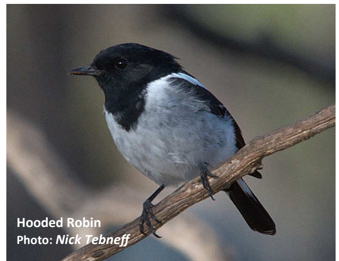
Hooded Robin