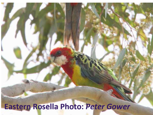
Eastern Rosella