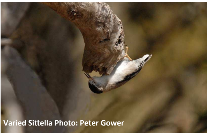
Varied Sittella