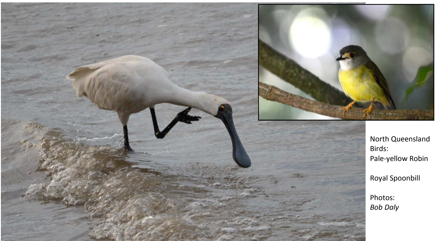
North Queensland Birds: Pale-yellow Robin