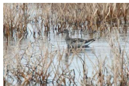
An unusual visitor in December was this Ruff among the reeds by Barrage Road, Goolwa.

IF you get lucky and find a bird unusual to the area please let us know as soon as possible and we will alert other members via email as we did when this Ruff was reported at Goolwa.