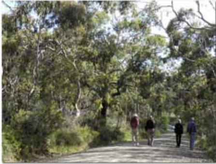
Leafy shade at Hindmarsh Falls yielded some brilliant sightings and songs, as from this Grey Shrike-thrush.