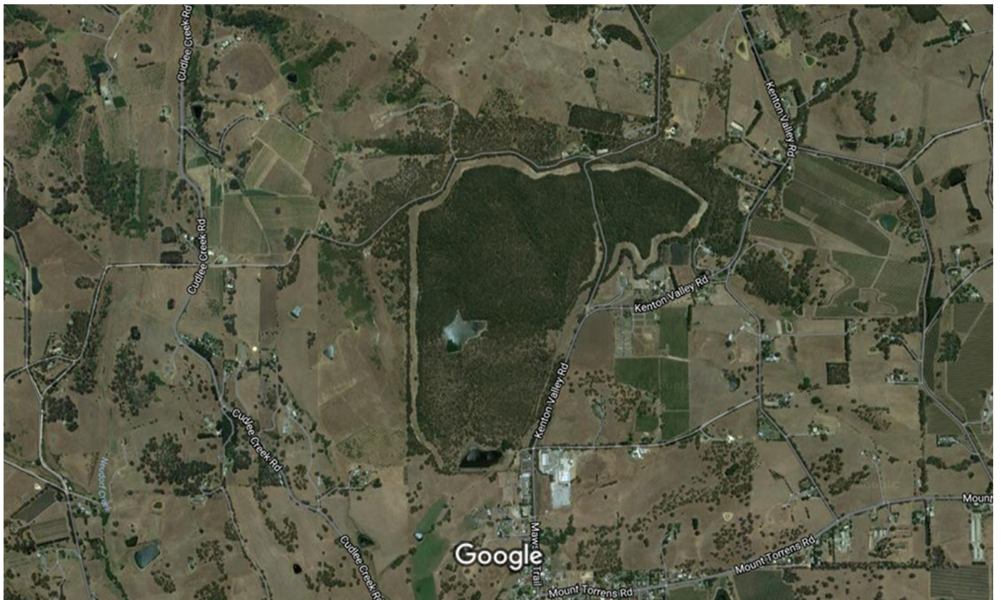
Imagery ©2016 Aerometrex, CNES / Astrium, Cnes/Spot Image, DigitalGlobe, Map data ©2016 Google 200 m