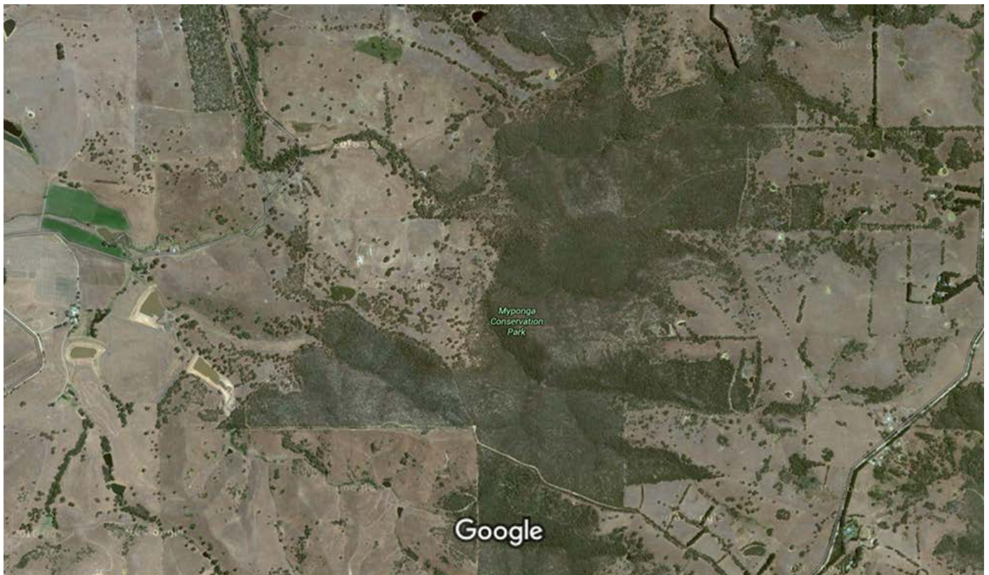
200 m