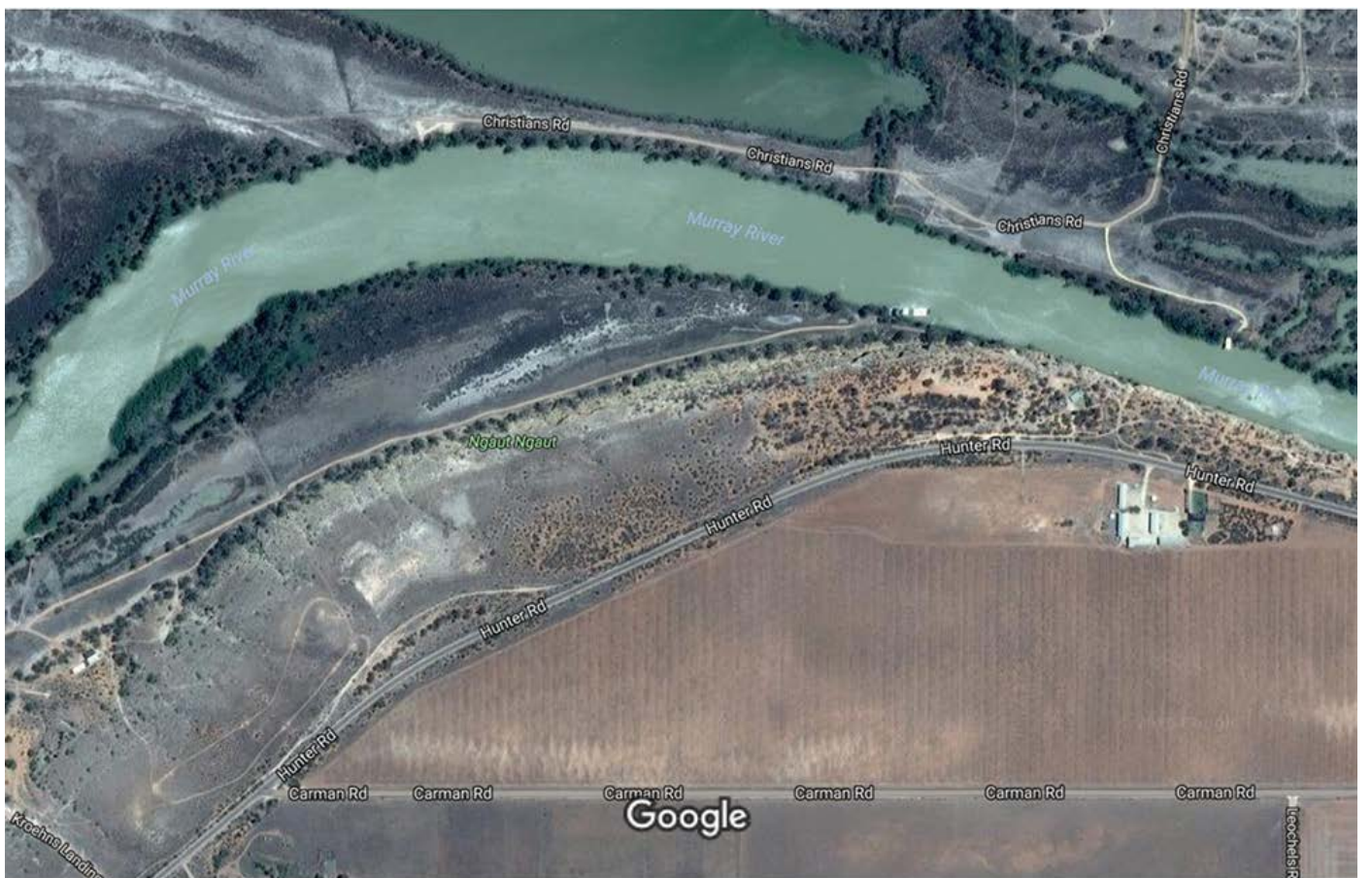
500 ft