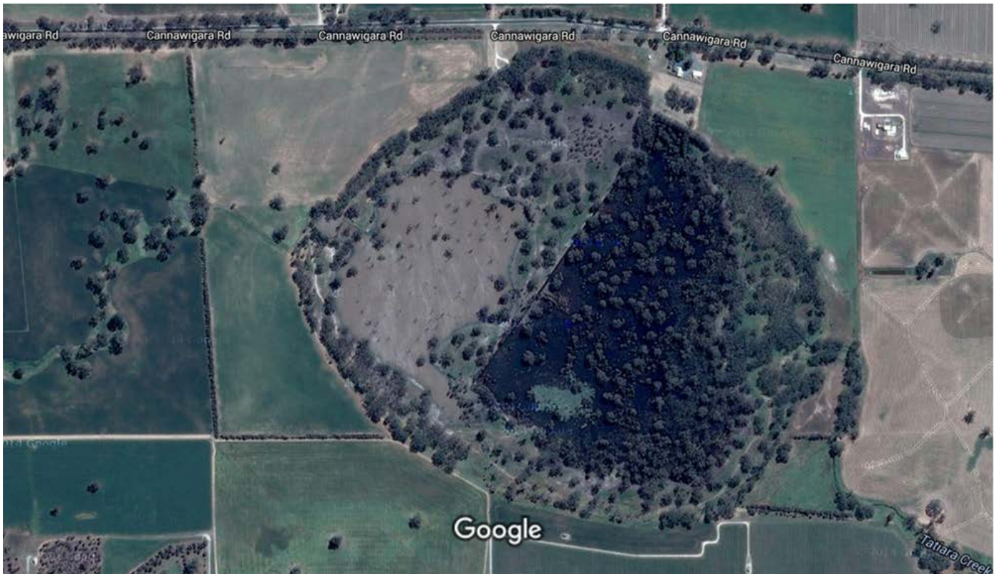
200 m