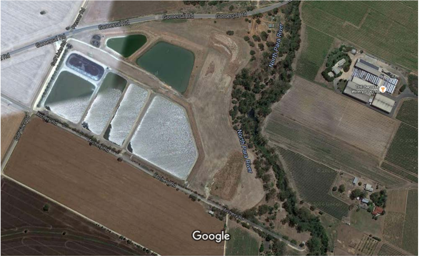
Imagery ©2016 CNES / Astrium, DigitalGlobe, Map data ©2016 Google 100 m