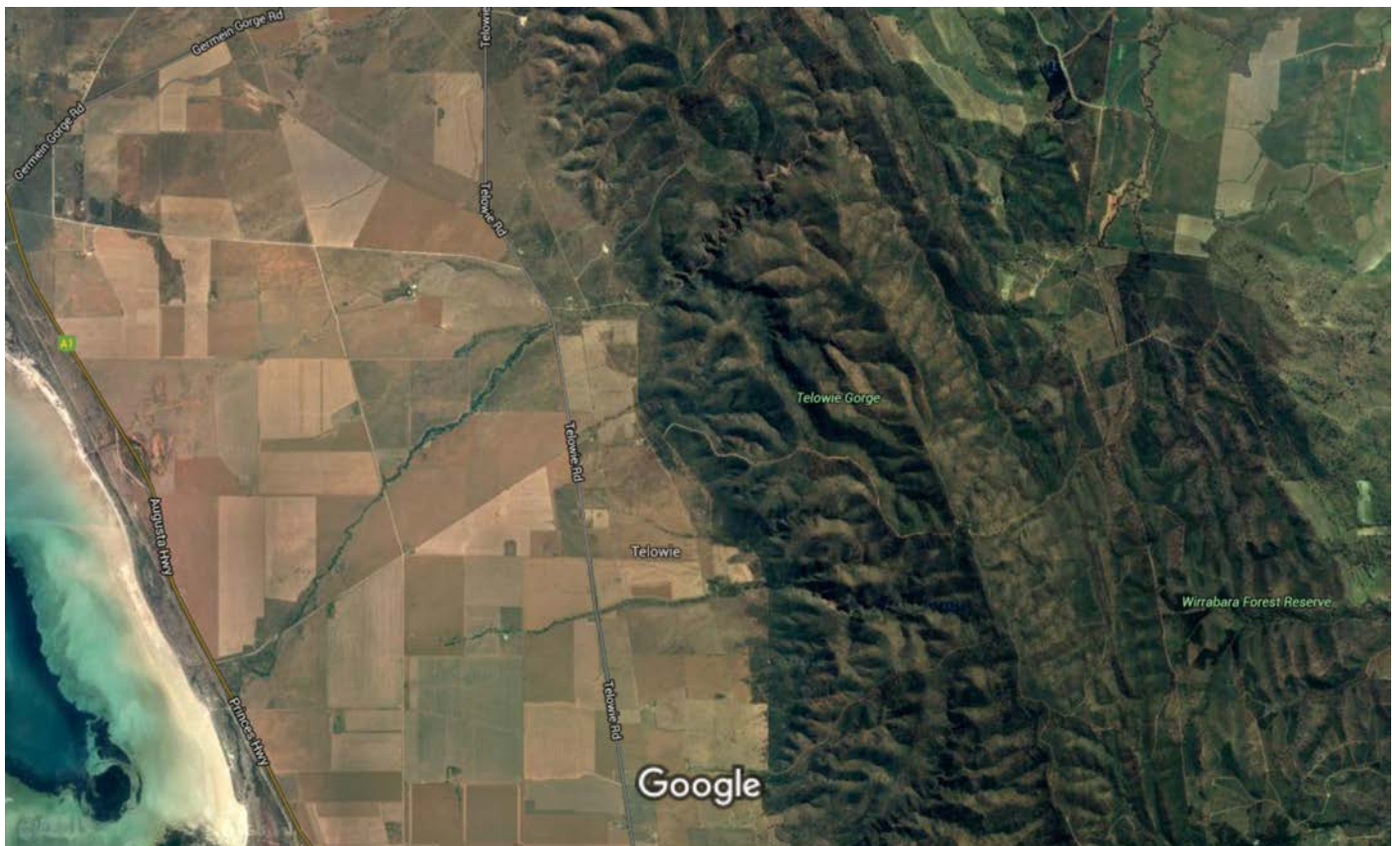
1 km