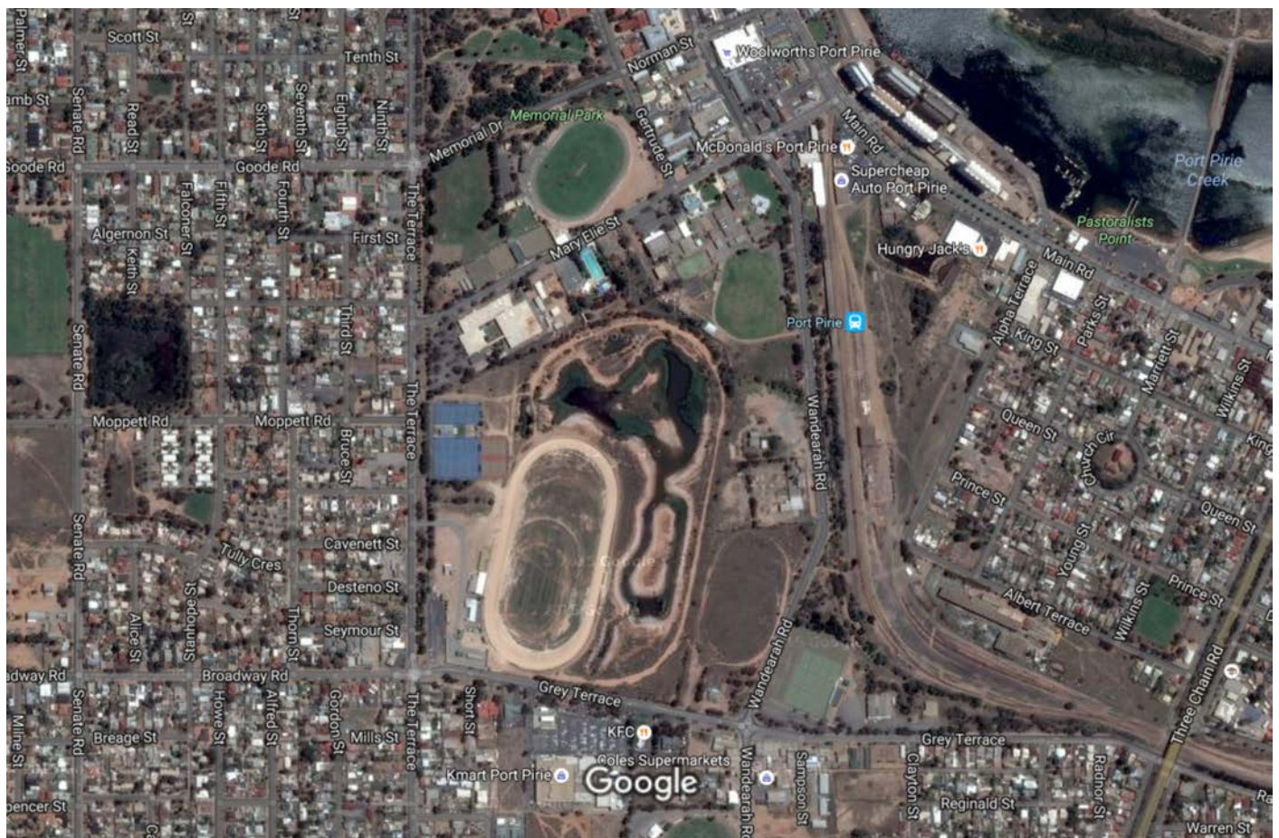
200 m