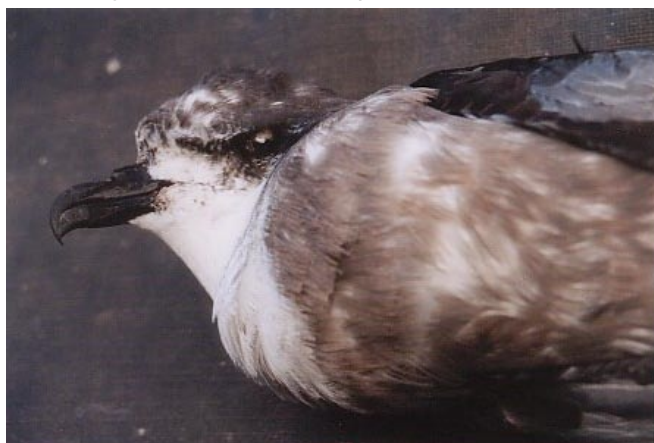
Left and right: Mottled Petrel at Clayton