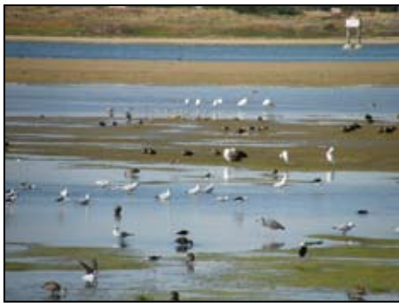
Below. Although there was little water in the river the birds gathered on the verges.