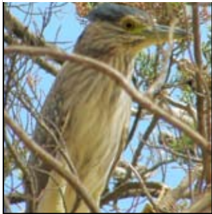
Above. Nankeen Night Heron peered from the pine tree near the barrage.