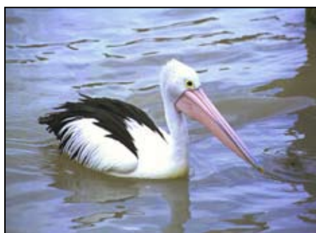
Australian Pelican on the River Murray at Mannum.