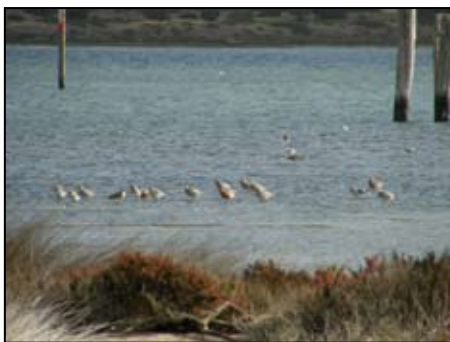
Bar-tailed Godwit below Goolwa barrage.