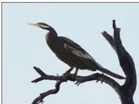
Darter poised for action, Currency Creek.