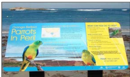
Interpretive signs will be located in different coastal towns in SA near sites where OBPs have been seen in the past. These will hopefully increase the awareness of the public regarding the habitat of this species and help lessen the threat to them.

0 OBPs, 151 Blue-winged Parrots, 8 Elegant Parrots, 0 Rock Parrots