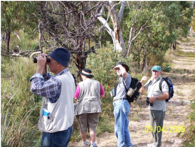
Our intrepid group at Manning Reserve